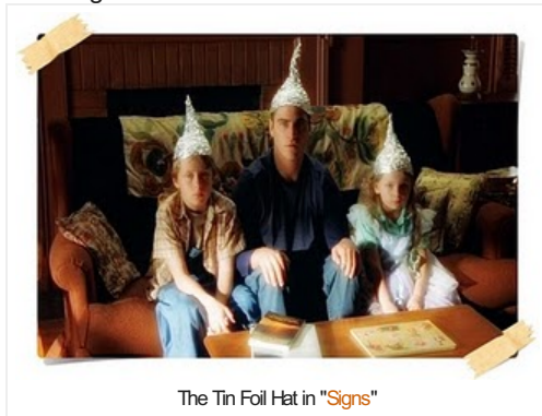
The Tin Foil Hat in "Signs"

Just in case you think this all a tad over-the-top, keep in mind that Menkin’s first attempt at a “thought-screen helmet,” prototype #1, was indeed composed of, in part, “20 sheets of aluminum foil.” Subsequent iterations deployed static shielding, eventually graduating to the use of Velostat, a carbon black impregnated packaging material used to transport electronic components in need of protection from electrostatic discharge.