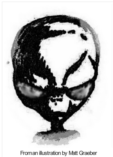
From an illustration by Matt Graeber

Obviously, the accounts involving the little Gray space creatures caring for the extremely young children (as well as the tiny fetuses) so closely resemble the medieval changeling myths we are obliged to pursue the possibility the current abduction phase of the UFO phenomenon may be directly related to the mounting termination of human life, social experimentation, discord, split-mindedness, and near obsession with the abortion issue here in United States.