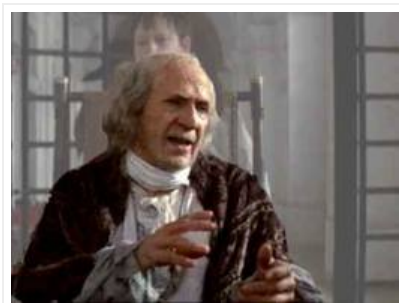
Salieri: I absolve you.