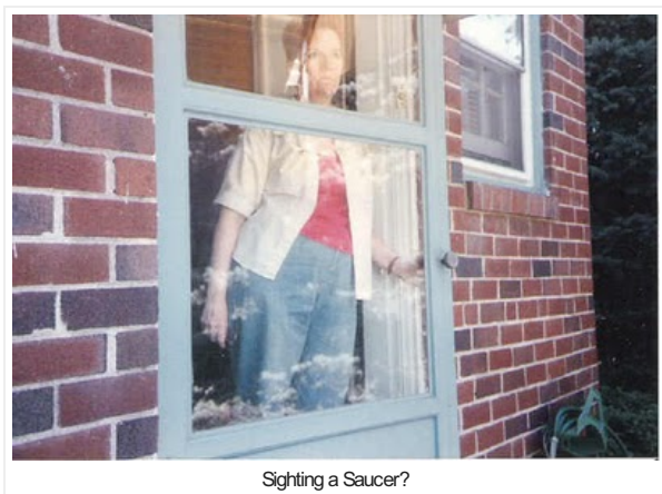
Sighting a Saucer?