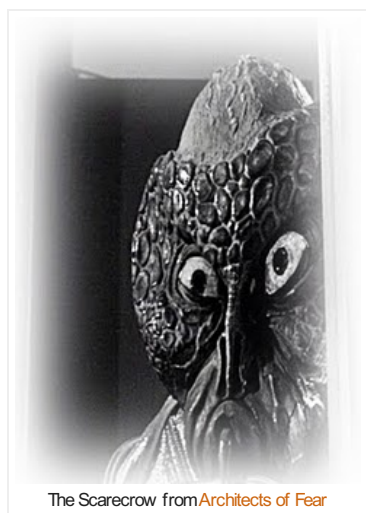
The Scarecrow from Architects of Fear

The show featured a kind of Star Chamber organized out of concerns about the Nuclear Arms Race. Their solution to the Cold War was the formation of a "common enemy" around which the world could unite. They decided to fake an alien invasion using a modified space capsule and a "genetically modified" human being. Culp undergoes both genetic and surgical alteration—which is how Jacobsen's "source" describes the alteration of the child pilots—designed to make him look like an alien being. He is supposed to crash-land the capsule near the United Nations, stagger if able to the General Assembly, and announce to the world that "more were on the way." Sounds like the Pickerings, doesn't it?