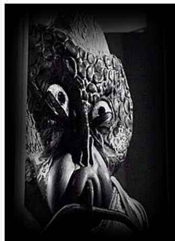
An American Exceptionalist?