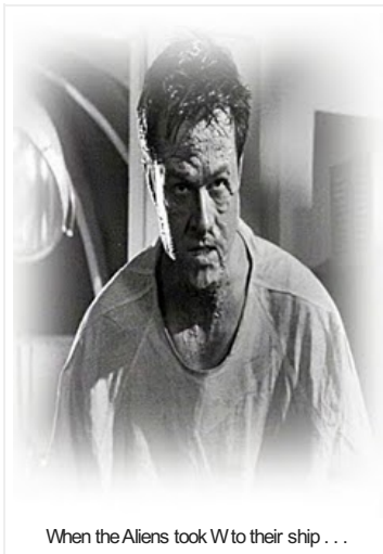
When the Aliens took W to their ship . . .

This latter idea is something both Skeptics and Nonskeptics have covered before. But if we "think strategically", like a "warfighter," as the military think tanks are always asking us to do, the analysis makes a certain amount of sense. You don't want American air space penetrated if you are an Air Force high muck-a-muck. Viewed in that light, it seems sensible and sober to take the paranoid view that Flying Saucers could be Soviet-era decoys, testing American air defenses, conducting reconnaissance and on occasion spooking the natives, a useful artifact of psychological warfare.